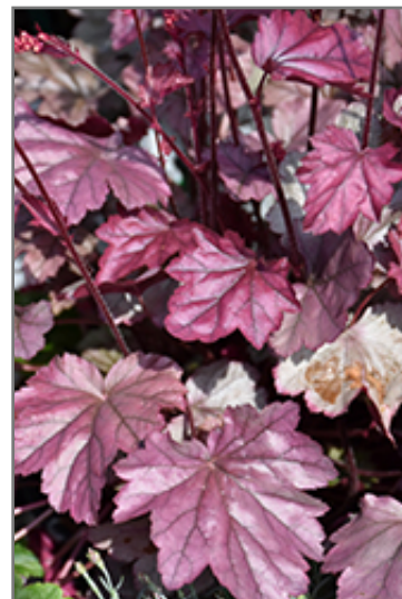
Stainless Steel Coral Bells foliage