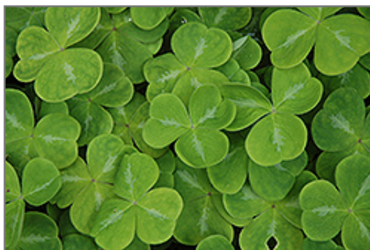
White European Liverleaf foliage