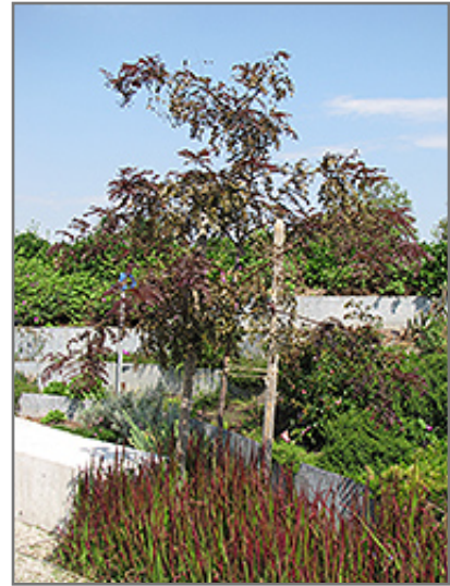
Ruby Lace Honeylocust

This plant is not reliably hardy in our region, and certain restrictions may apply; contact the store for more information.