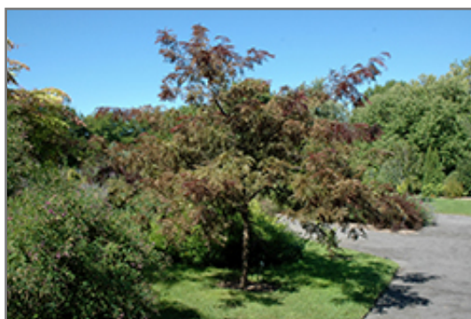
Ruby Lace Honeylocust