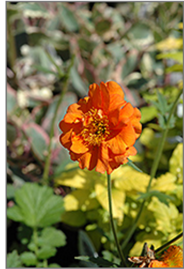
Starker's Magnificum Avens flowers