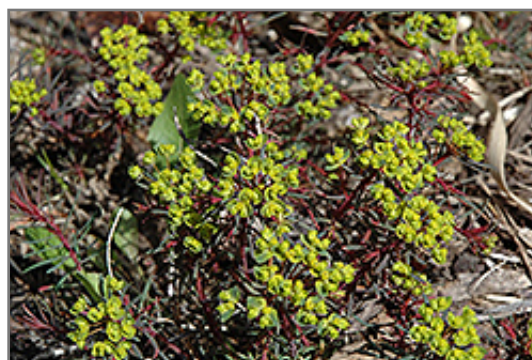
Fen's Ruby Cypress Spurge in bloom