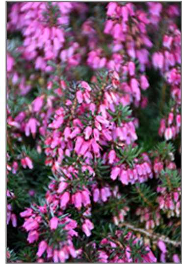
Tanja Heath flowers