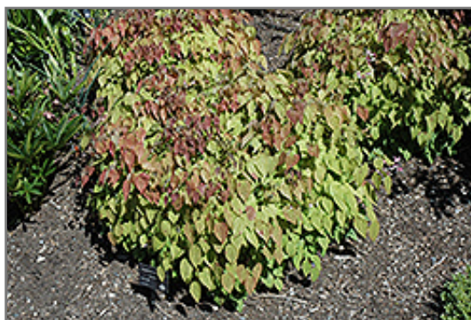
Tama No Genpei Bishop's Hat in bloom