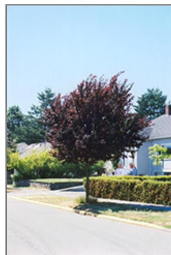
Newport Plum