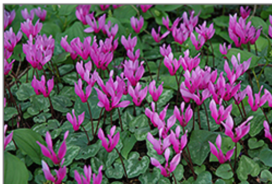
Purple Cyclamen in bloom