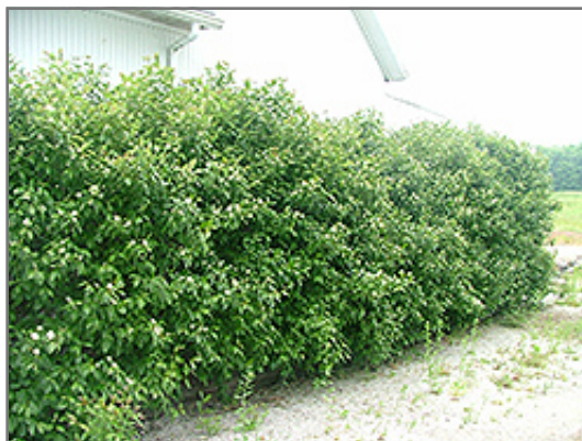
Geauga Gray Dogwood