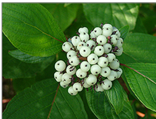
Chief Bloodgood Dogwood fruit