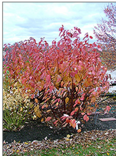
Chief Bloodgood Dogwood in fall