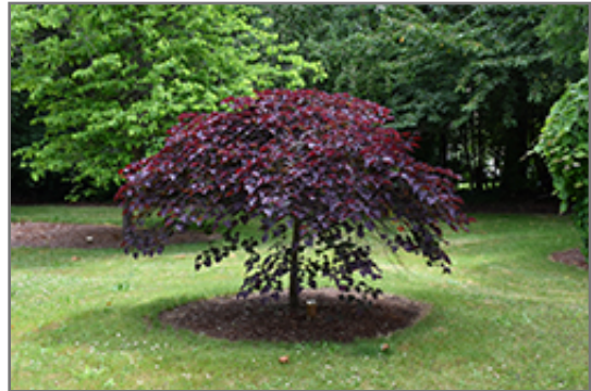
Ruby Falls Redbud

This plant is not reliably hardy in our region, and certain restrictions may apply; contact the store for more information.