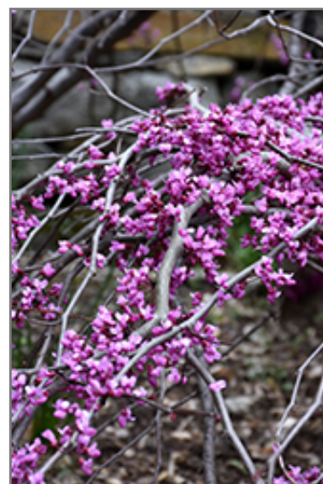
Ruby Falls Redbud flowers