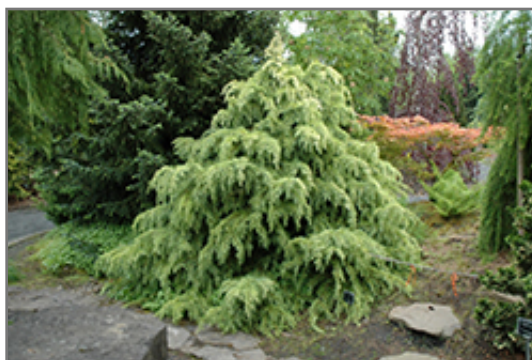
Silver Mist Deodar Cedar