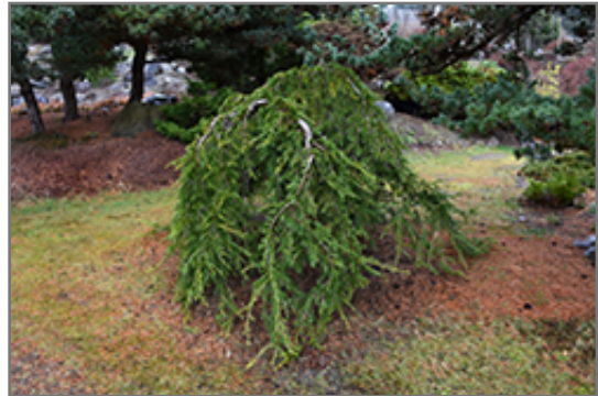
Repandens Deodar Cedar