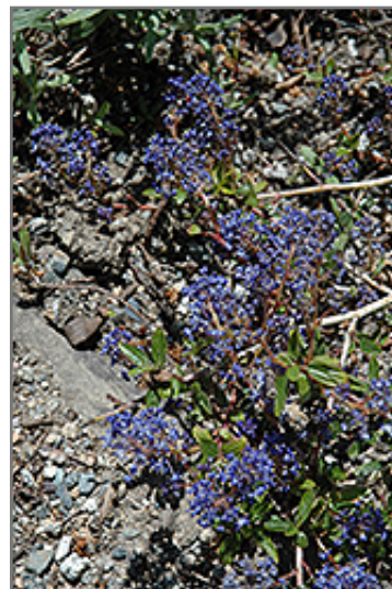
Lemmon's Ceanothus flowers

Lemmon's Ceanothus will grow to be about 24 inches tall at maturity, with a spread of 5 feet. It tends to fill out right to the ground and therefore doesn't necessarily require facer plants in front. It grows at a medium rate, and under ideal conditions can be expected to live for approximately 30 years.