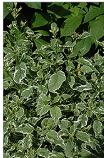
Variegated Bluebeard foliage