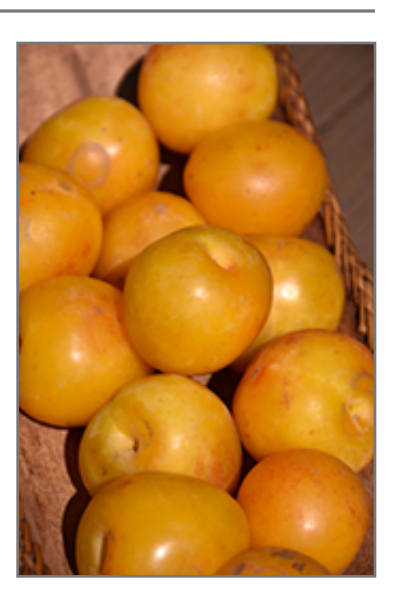
Brookgold Plum fruit