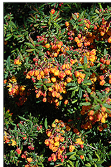
Dwarf Coral Hedge Barberry flowers