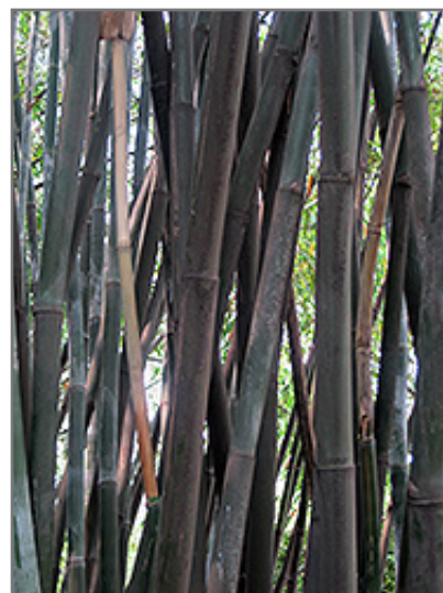
Chinese Goddess Bamboo bark