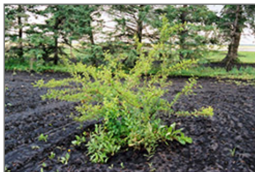
Sapalta Cherry-Plum