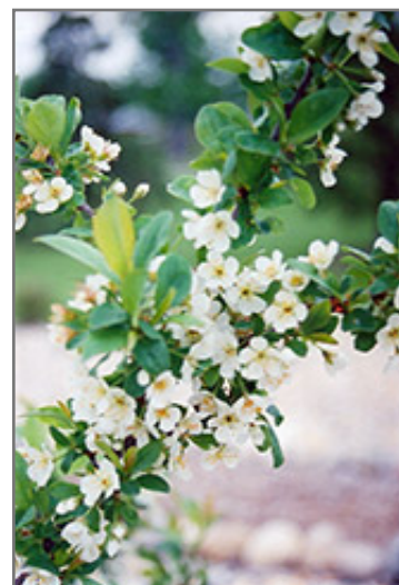
Opata Cherry-Plum flowers