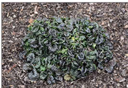
Mini Crisp Red Bugleweed