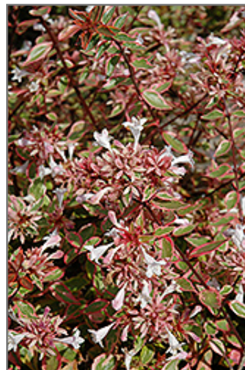
Sunshine Daydream Abelia flowers