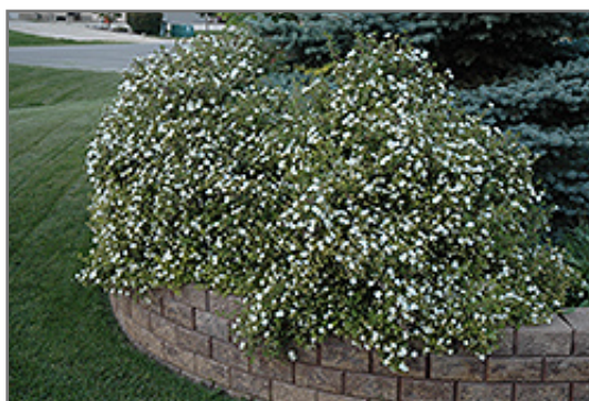
Abbotswood Potentilla in bloom