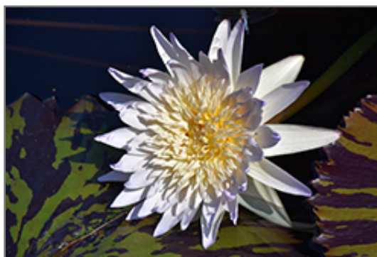
Avalanche Tropical Water Lily flowers