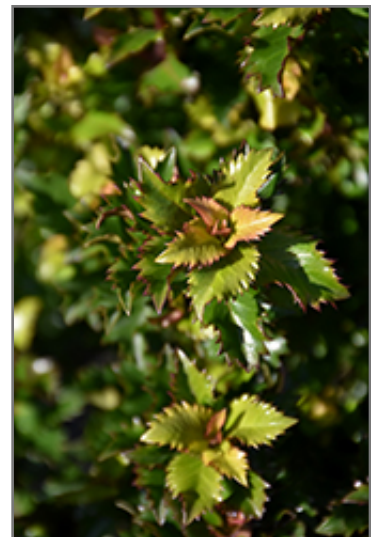
Little Rascal Meserve Holly foliage