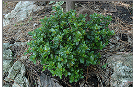
Little Rascal Meserve Holly