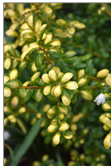
Drops Of Gold Japanese Holly foliage