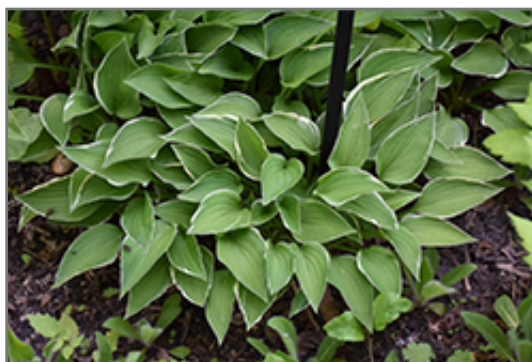
Allan P. McConnell Hosta foliage