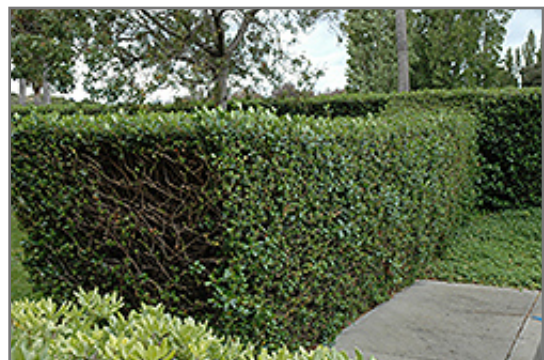
Red Escallonia