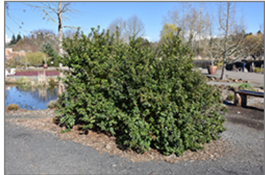
Red Escallonia

This plant is not reliably hardy in our region, and certain restrictions may apply; contact the store for more information.