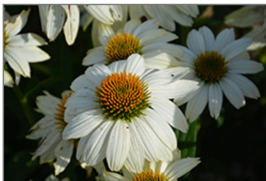
PowWow White Coneflower flowers

PowWow White Coneflower is recommended for the following landscape applications;