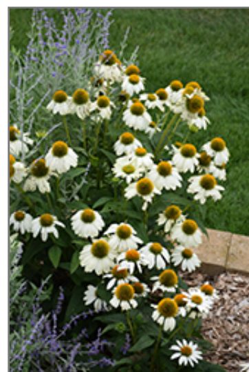
PowWow White Coneflower in bloom