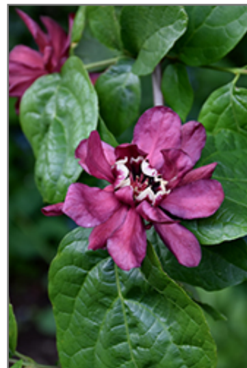
Hartlage Wine Sweetshrub flowers