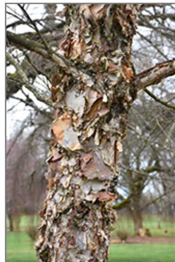
City Slicker River Birch bark

City Slicker River Birch will grow to be about 60 feet tall at maturity, with a spread of 50 feet. It has a low canopy with a typical clearance of 3 feet from the ground, and should not be planted underneath power lines. It grows at a fast rate, and under ideal conditions can be expected to live for 70 years or more.