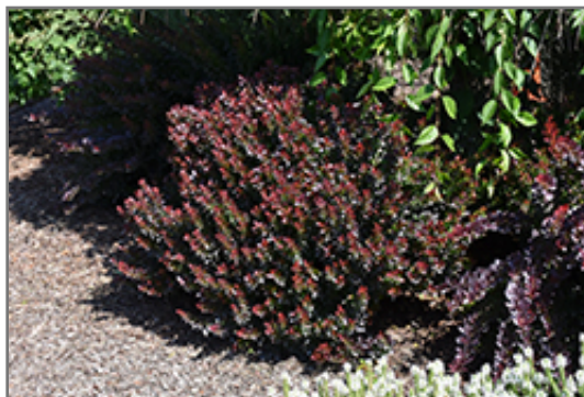
Midnight Ruby Barberry