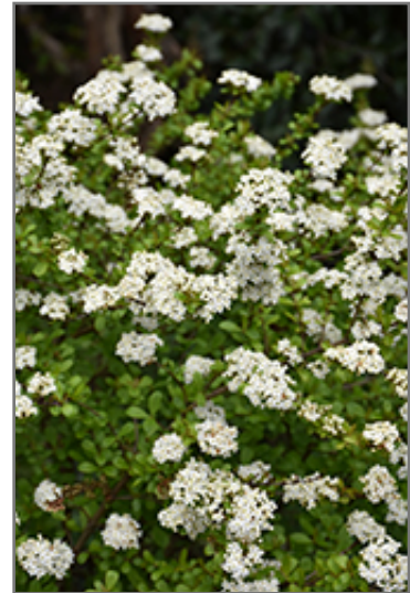
Whorled Class Viburnum flowers

Whorled Class Viburnum is recommended for the following landscape applications;