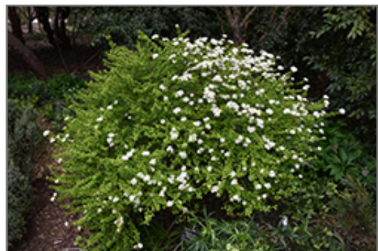
Whorled Class Viburnum in bloom