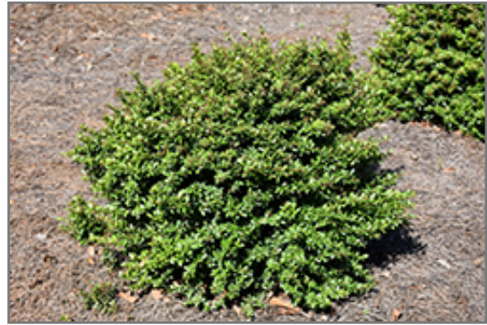
Whorled Class Viburnum

This plant is not reliably hardy in our region, and certain restrictions may apply; contact the store for more information.