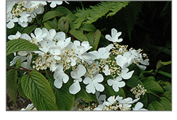
Triumph Doublefile Viburnum in bloom

Triumph Doublefile Viburnum is covered in stunning cymes of white round flowers held atop the branches in late spring. It has dark green deciduous foliage. The serrated pointy leaves turn an outstanding brick red in the fall.