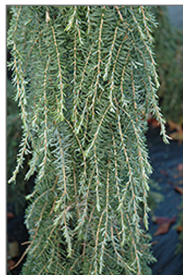
Thorsen's Weeping Hemlock foliage