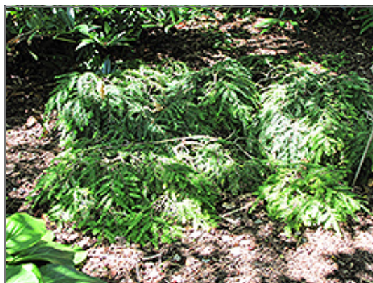
Prostrata Hemlock

A dwarf variety that is very low growing with fine dark green foliage; can be used as a low accent or groundcover; needs organic, acidic soil, adequate moisture and shelter from drying winds