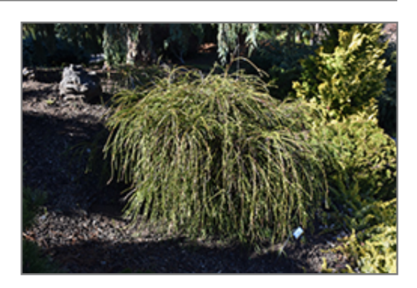
Whipcord Arborvitae

This shrub does best in full sun to partial shade. It prefers to grow in average to moist conditions, and shouldn't be allowed to dry out. It is not particular as to soil type or pH. It is somewhat tolerant of urban pollution, and will benefit from being planted in a relatively sheltered location. Consider applying a thick mulch around the root zone in winter to protect it in exposed locations or colder microclimates. This is a selection of a native North American species.