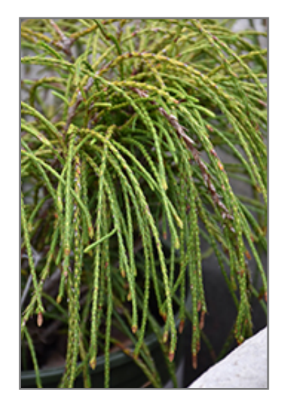
Whipcord Arborvitae foliage