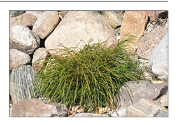
Whipcord Arborvitae

Whipcord Arborvitae is recommended for the following landscape applications;