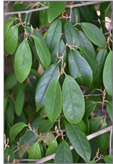
Chinese Fighazel foliage