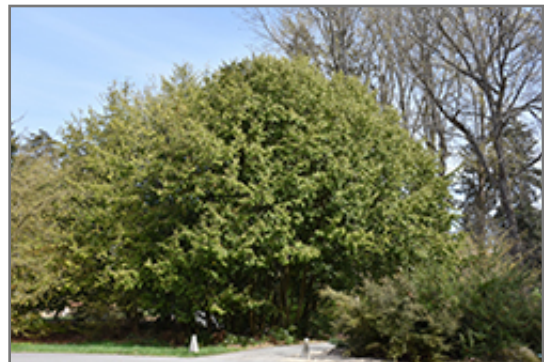
Chinese Fighazel