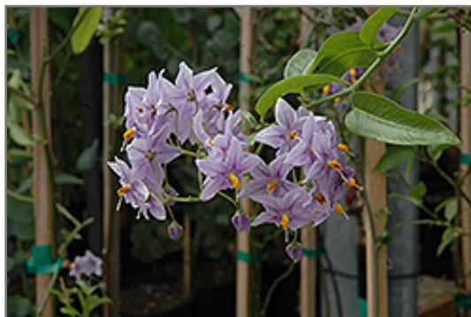
Glasnevin Chilean Potato Bush flowers