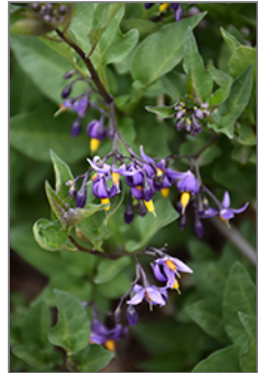
Glasnevin Chilean Potato Bush flowers

This plant should only be grown in full sunlight. It prefers to grow in average to moist conditions, and shouldn't be allowed to dry out. It is not particular as to soil type or pH. It is somewhat tolerant of urban pollution. Consider applying a thick mulch around the root zone in winter to protect it in exposed locations or colder microclimates. This is a selected variety of a species not originally from North America, and parts of it are known to be toxic to humans and animals, so care should be exercised in planting it around children and pets.