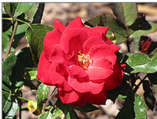
Red Simplicity Rose flowers

Glowing red blooms appear throughout the season on this dense bushy shrub with dark green, glossy foliage for a backdrop; well suited for containers, as a landscape accent, or a flowering hedge