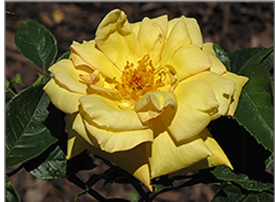
Christel von der Post Rose flowers

Christel von der Post Rose will grow to be about 5 feet tall at maturity, with a spread of 4 feet. It tends to fill out right to the ground and therefore doesn't necessarily require facer plants in front, and is suitable for planting under power lines. It grows at a fast rate, and under ideal conditions can be expected to live for approximately 30 years.