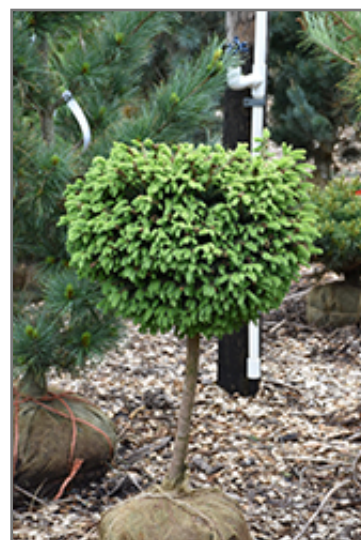
Little Gem Spruce (tree form)