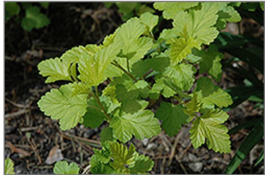
Common Ninebark foliage

Common Ninebark will grow to be about 10 feet tall at maturity, with a spread of 10 feet. It has a low canopy, and is suitable for planting under power lines. It grows at a medium rate, and under ideal conditions can be expected to live for approximately 30 years.