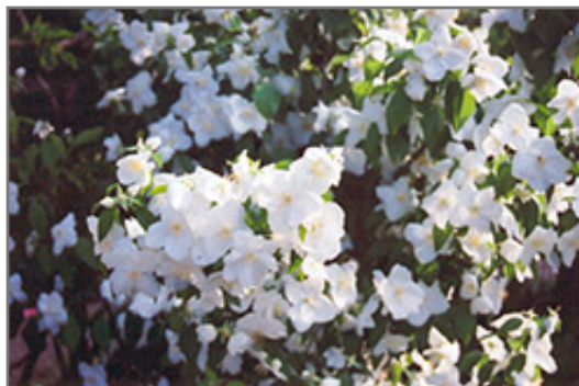
Belle Etoile Mockorange flowers