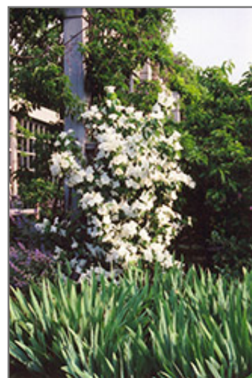
Belle Etoile Mockorange in bloom