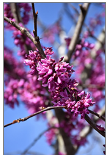
Eastern Redbud (tree form) flowers