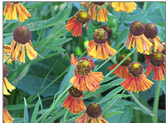
Bruno Helenium flowers