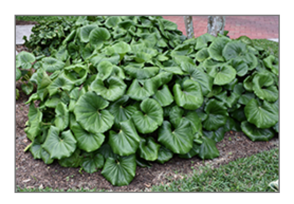
Giant Leopard Plant

Giant Leopard Plant is recommended for the following landscape applications;