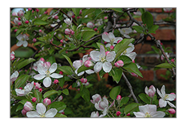
Golden Delicious Apple flowers