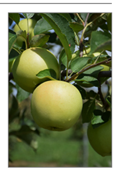
Golden Delicious Apple fruit

Golden Delicious Apple features showy clusters of lightly-scented white flowers with shell pink overtones along the branches in mid spring, which emerge from distinctive pink flower buds. It has forest green deciduous foliage. The pointy leaves turn yellow in fall. The fruits are showy chartreuse apples with yellow overtones, which are carried in abundance in mid fall. The fruit can be messy if allowed to drop on the lawn or walkways, and may require occasional clean-up.