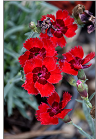
Fire Star Pinks flowers

Fire Star Pinks is recommended for the following landscape applications;